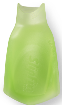
Volt Green [.169]