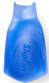
Marine Blue [.189]