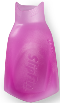
Deep Pink [.179]